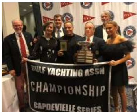
2022 GYA Capdevielle Series Champions – Buccaneer Yacht Club