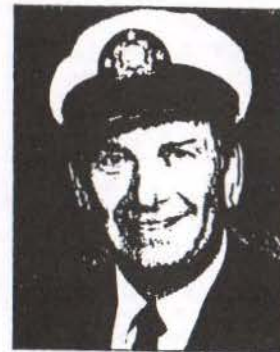
Commodore Lloyd Parsons New Orleans