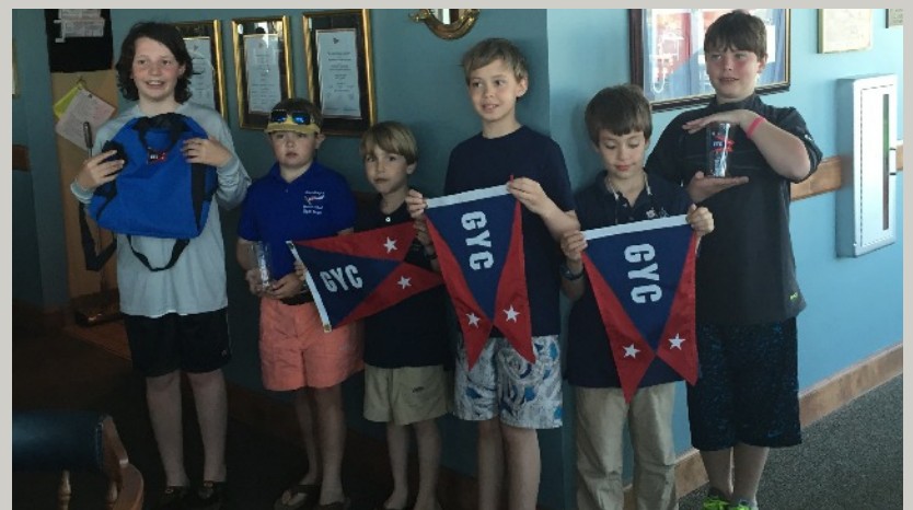
Optimist Green Fleet Skippers