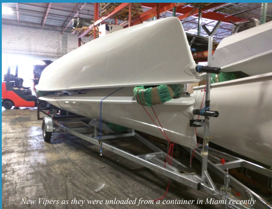
New Vipers as they were unloaded from a container in Miami recently

We'll be on the water and working with Zeke Horowitz from North Sails helping you learn the sailing aspects as well. We're anticipating a good turnout of Vipers racing for the weekend (15-20), we look forward to seeing you there and helping you learn your new boats!