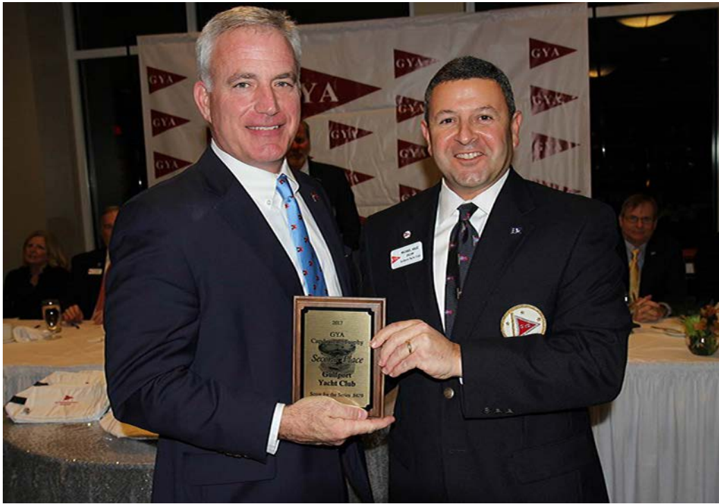
2017 GYA Capdevielle Second Place - GYC