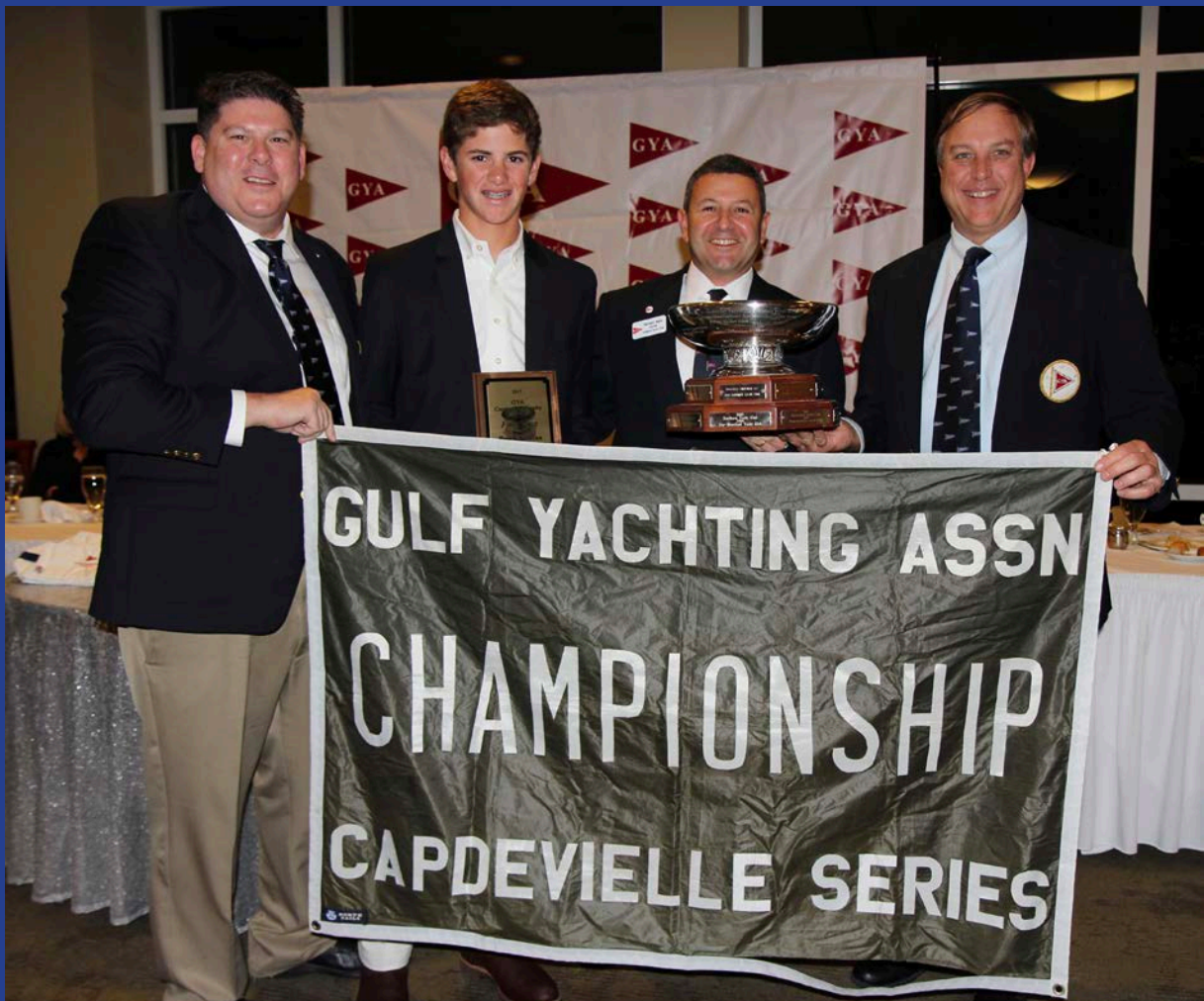
2017 GYA Capdevielle Winners - PCYC