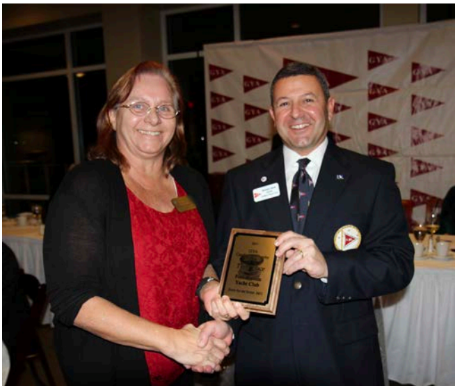
2017 GYA Capdevielle Challenger Winner -FWYC