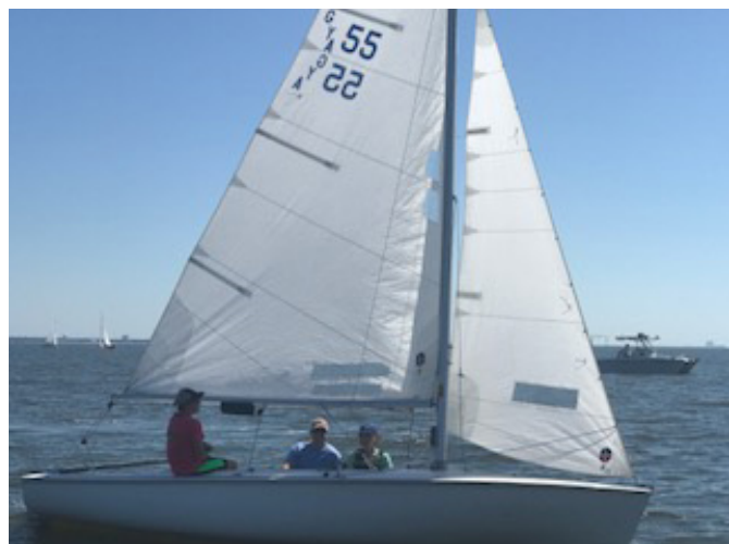
Flying Scot sailing out to the course