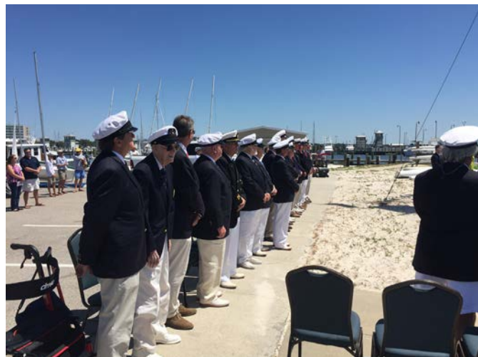
GYA Club Commodores at the Opening Flag Raising